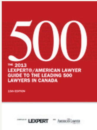
The 2013 Lexpert/American Lawyer Guide to the Leading 500 Lawyers in Canada.

Lexpert, Canada's most respected legal publication, conducts an annual survey with lawyers acknowledged as leaders in their respective fields, to identify leading practitioners and firms across Canada. As published in the 2013 Lexpert Guide to the Leading 500 Lawyers in Canada, Farris is recognized as one of Vancouver's leading corporate and litigation law firms.